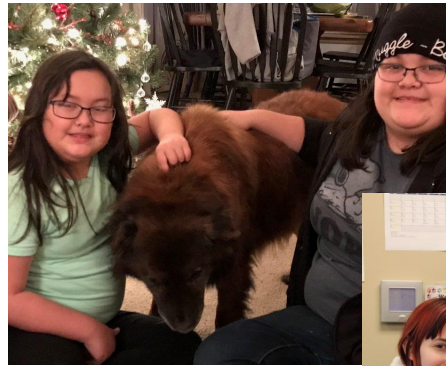
Above: Chappy and his new forever family.

We had the pleasure of helping another dog have her puppies! Bernadette brought three amazing bundles of joy: Caleb, Olivia, and Gabriel. Later in the winter, two very ill puppies named Sandra and Rose were brought in. Sadly, someone had feed them a large amount of cherries and they were suffering from Cherry Pit Cyanide Poisoning. With some quick thinking, a mega dose of vitamin K along with deworming, they pulled through and found their forever families!