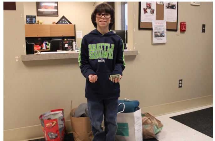
Above: Young man donated his birthday money to buy food, toys, and blankets for our dogs.

This winter, two young men donated their birthday/Christmas money to buy food, toys, and blankets for dogs in our shelter.