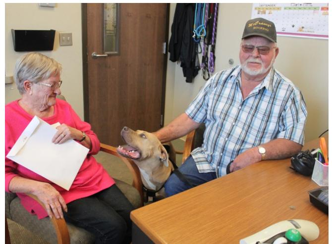
Another one of our dogs has found a home!

For more information about Benton County Canine Shelter or to pick up a newsletter, contact us at: