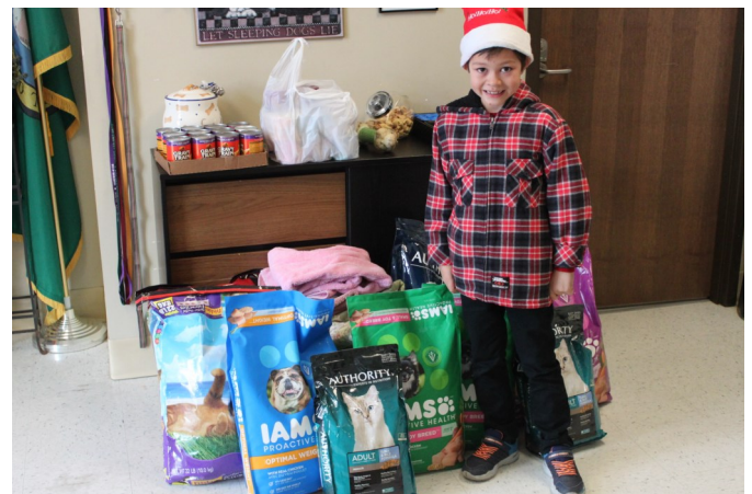
Below: Young man donated his Christmas to support our shelter dogs buy purchasing food, toys, and blankets.

THANK YOU TO THE FOLLOWING ORGANIZATIONS, YOUR SUPPORT AND HELP IS GREATLY APPRECIATED!